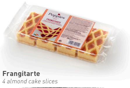
Frangitarte 4 almond cake slices