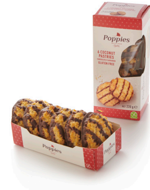
Belgian Choc Macaroons

6 large soft coconut macaroons with chocolate flavoured decoration