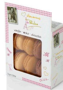
6 Biscuits Macarons Vanilla, mocha, chocolate

R013756 Weight: 72 g CU/outer case: 12 Cases/EU pallet: 143 Shelf life in months: 11