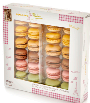
24 Biscuits Macarons Vanilla, chocolate, strawberry, pistachio, lemon, mocha

R019231 Weight: 144 g CU/outer case: 12 Cases/EU pallet: 91 Shelf life in months: 11