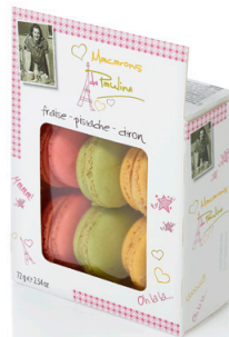
6 Biscuits Macarons Strawberry, pistachio, lemon

R013755 Weight: 72 g CU/outer case: 10 Cases/EU pallet: 180 Shelf life in months: 11