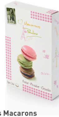
6 Biscuits Macarons Strawberry, pistachio, chocolate

R014277 Weight: 36 g CU/outer case: 20 Cases/EU pallet: 180 Shelf life in months: 11