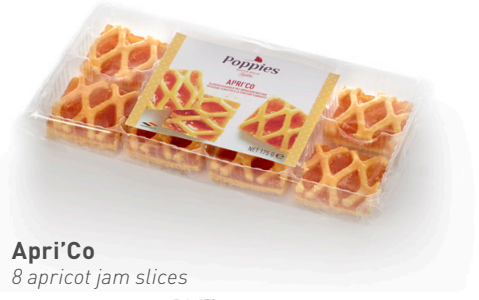
Apri'Co 8 apricot jam slices

Cases/EU pallet: 144 Shelf life in months: 4