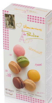
12 Biscuits Macarons Vanilla, chocolate, strawberry, pistachio, lemon, mocha

R013804 Weight: 108 g CU/outer case: 12 Cases/EU pallet: 96 Shelf life in months: 11