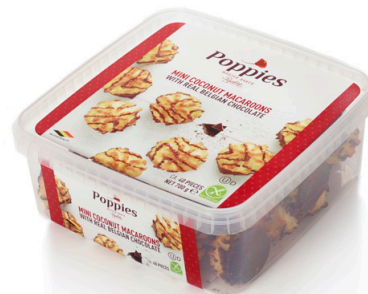
Mini Coconut Macaroons Chocolate

Tub with 40 coconut macaroons with Belgian chocolate