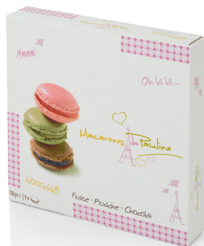
9 Biscuits Macarons Strawberry, pistachio, chocolate

R013804 Weight: 108 g CU/outer case: 12 Cases/EU pallet: 96 Shelf life in months: 11