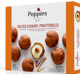
Salted Caramel Profiteroles ± 12 profiteroles with a creamy filling, a salted caramel core and a salted chocolate flavoured coating

R016471 Weight: 200 g CU/outer case: 8 Cases/EU pallet: 104 Shelf life in months: 18