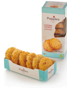
Belgian Coconut Macaroons 6 large soft coconut macaroons