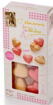
8 Heart Shaped Macarons Vanilla & strawberry flavour

R026910 Weight: 288 g Cases/EU pallet: 49 CU/outer case: 10 Shelf life in months: 11