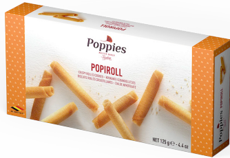
Popiroll Crispy rolled cookies

R004936 Weight: 125 g Cases/EU pallet: 110 CU/outer case: 12 Shelf life in months: 12