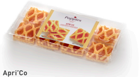
Apri'Co 8 apricot jam slices

Cases/EU pallet: 144 Shelf life in months: 4