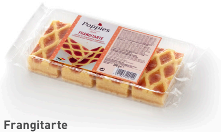
Frangitarte 4 almond cake slices