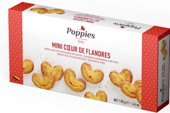
Mini Cœur de Flandres Sugar glazed heart shaped puff pastry cookies

R026963 Weight: 180 g Cases/EU pallet: 77 CU/outer case: 14 Shelf life in months: 12