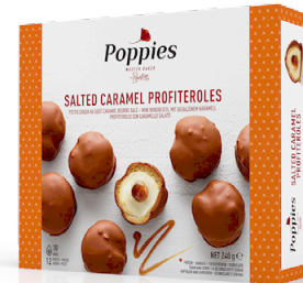
Salted Caramel Profiteroles ± 12 profiteroles with a creamy filling, a salted caramel core and a salted chocolate flavoured coating

R016471 Weight: 200 g CU/outer case: 8 Cases/EU pallet: 104 Shelf life in months: 18