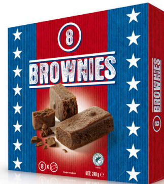
Brownies 8 single wrapped brownies with Belgian chocolate

Cases/EU pallet: 108 Shelf life in months: 4