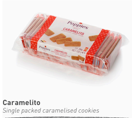
Caramelito Single packed caramelised cookies