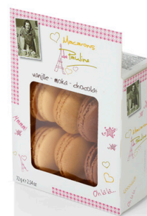
6 Biscuits Macarons Vanilla, mocha, chocolate

Cases/EU pallet: 143 Shelf life in months: 11