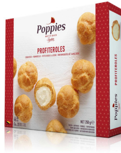
Profiteroles ± 20 profiteroles filled with dairy cream

“Light and crisp profiteroles, filled with fresh whipped cream or with a trendy salted caramel core, coated with chocolate decoration or just powdered with sugar. Freshly baked, cooled and immediately frozen.”