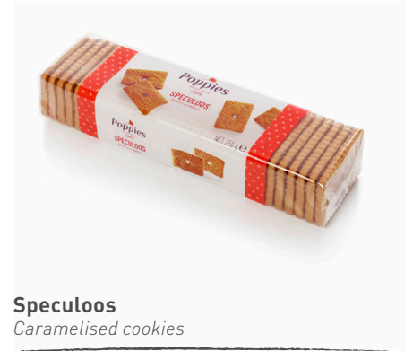
Speculoos Caramelised cookies

Cases/EU pallet: 180 Shelf life in months: 9