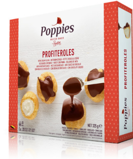
Profiteroles ± 20 profiteroles filled with dairy cream and 2 sachets of chocolate sauce

R006051 Weight: 250 g CU/outer case: 10 Cases/EU pallet: 77 Shelf life in months: 18