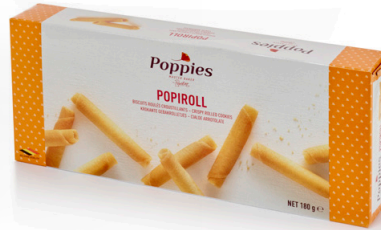
Popiroll Crispy rolled cookies

R004936 Weight: 125 g Cases/EU pallet: 110 CU/outer case: 12 Shelf life in months: 12