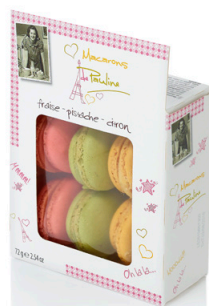
6 Biscuits Macarons Strawberry, pistachio, lemon

Cases/EU pallet: 180 Shelf life in months: 11