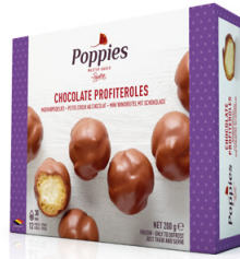
Chocolate Enrobed Profiteroles ± 12 profiteroles with a creamy filling and a milk chocolate coating

R004633 Weight: 325 g CU/outer case: 8 Cases/EU pallet: 99 Shelf life in months: 18