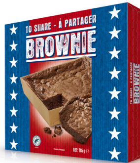
Brownie à partager One big brownie with Belgian chocolate to share

Cases/EU pallet: 72 Shelf life in months: 4