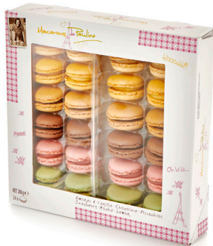
24 Biscuits Macarons Vanilla, chocolate, strawberry, pistachio, lemon, mocha

R019231 Weight: 144 g Cases/EU pallet: 91 CU/outer case: 12 Shelf life in months: 11