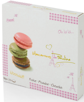
9 Biscuits Macarons Strawberry, pistachio, chocolate

R013804 Weight: 108 g Cases/EU pallet: 96 CU/outer case: 12 Shelf life in months: 11