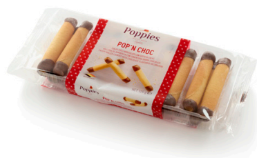
Pop'n Choc Crispy rolled cookies, dipped in chocolate flavoured decoration

R004391 Weight: 125 g Cases/EU pallet: 120 CU/outer case: 12 Shelf life in months: 12