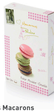
6 Biscuits Macarons Strawberry, pistachio, chocolate

Cases/EU pallet: 180 Shelf life in months: 11