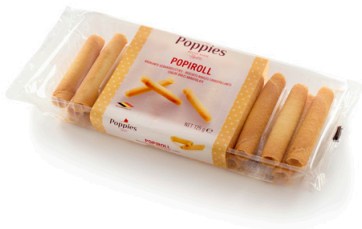
Popiroll Crispy rolled cookies

R010456 Weight: 125 g Cases/EU pallet: 110 CU/outer case: 12 Shelf life in months: 12