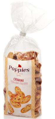
Crakini Crispy sugar glazed pretzels

R011421 Weight: 250 g CU/outer case: 18 Cases/EU pallet: 100 Shelf life in months: 9