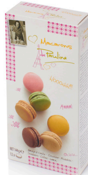
12 Biscuits Macarons Vanilla, chocolate, strawberry, pistachio, lemon, mocha

R013804 Weight: 108 g Cases/EU pallet: 96 CU/outer case: 12 Shelf life in months: 11