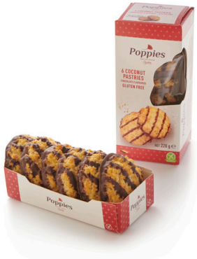
Belgian Coconut Macaroons 6 large soft coconut macaroons